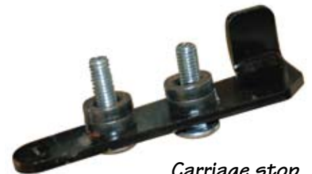
Carriage stop with spacers (LH2000)